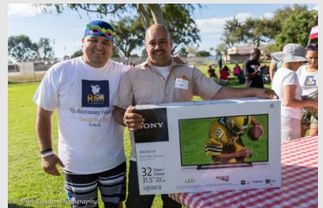
One of the Awesome Raffle Prizes

PROVIDING QUALITY SECURITY SERVICES TO AMERICA'S TOP FORTUNE 500 COMPANIES FOR MORE THAN A DECADE