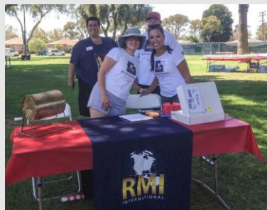
Picnic Check-in Station